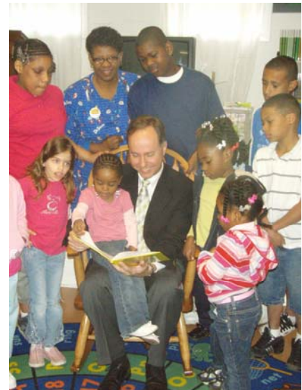
Above, Rep. Robin Vos reads a book to students at the Cops-N-Kids Reading Center

Representative Vos was very impressed with the Center and all it had to offer. He indicated that he looks forward to working with a bipartisan coalition of Racine area legislators and Governor Doyle to help with the Center's progress in the future.